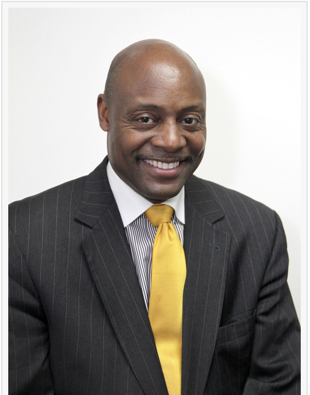
President of the National Black Church Initiative